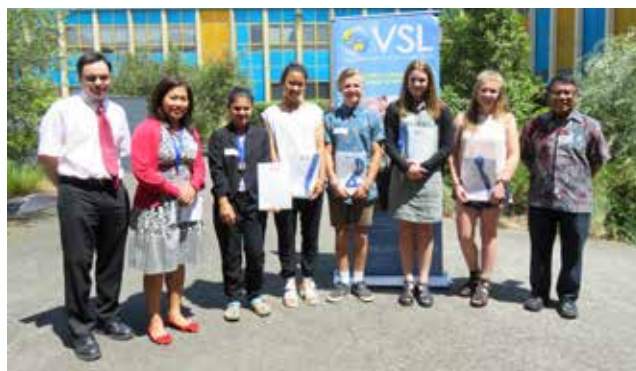
Distance Education Awards Day - Indonesian students with teachers