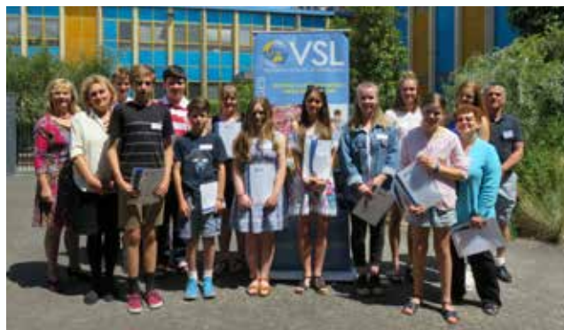
Distance Education Awards Day - French students with teachers