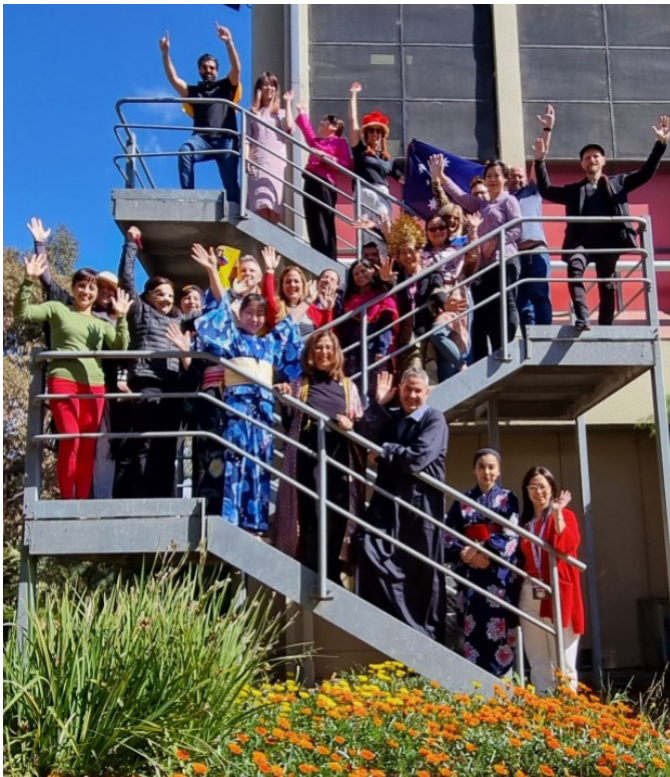
Distance Education Teachers on Cultural Dress Day

No two days at VSL Distance Education can ever really be the same. Not only do we teach thirteen different languages across the secondary levels, but our teachers and students come from even more diverse linguistic and cultural backgrounds. It's fair to say that there is always plenty going on!