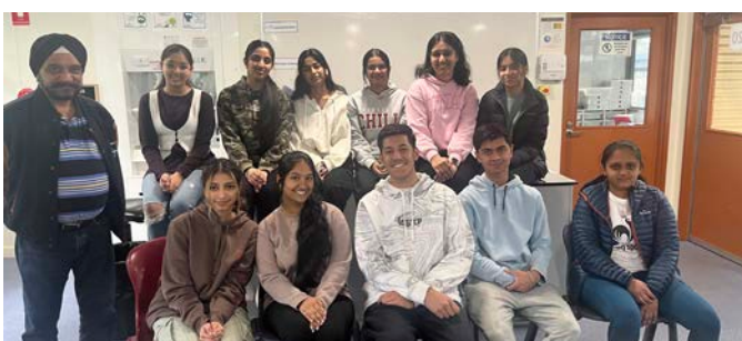
Hindi (Berwick), Punjabi (Hampton Park) and Hindi (Dandenong)