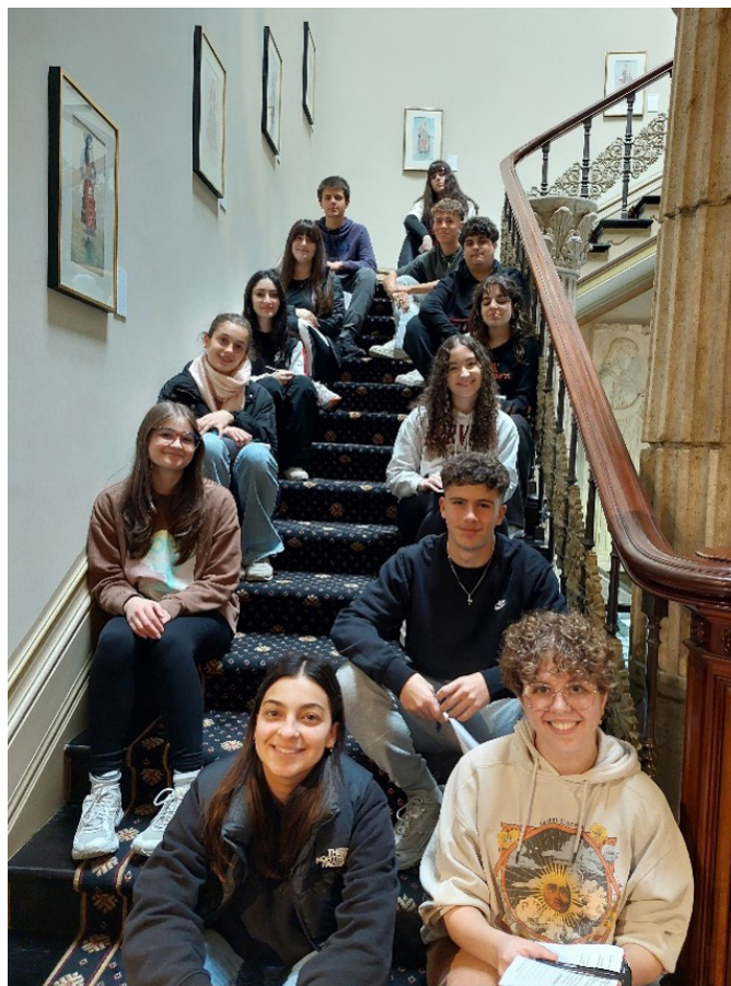
Greek students at the Hellenic Museum

What a year it has been! And 2024 is shaping to be just as exciting for us, with many initiatives continuing to develop in the new year. But first, it's time to step back and reflect upon the achievements and growth of students, families, and staff over the course of this year. And then it's time to rest.