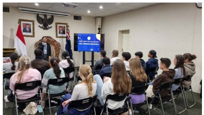
Indonesian students at the Indonesian Consulate

Each semester, these weekly ratings are amalgamated to provide statistics for our new reporting system.